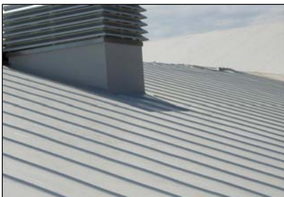
Vinyl Rib roofing system installed.